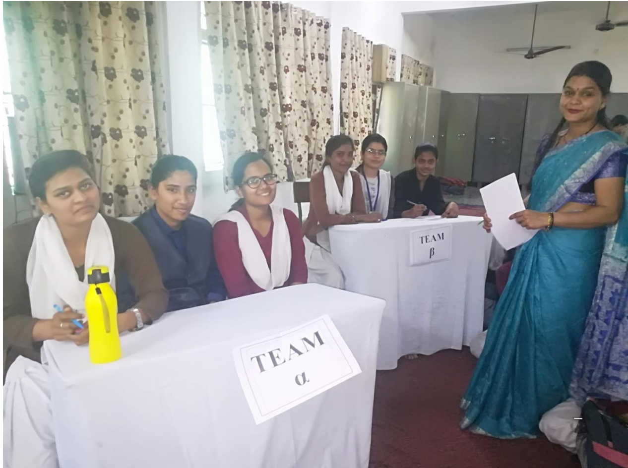
Mathematical Quiz held on 07/02/19 to celebrate e- day (exponential Day)