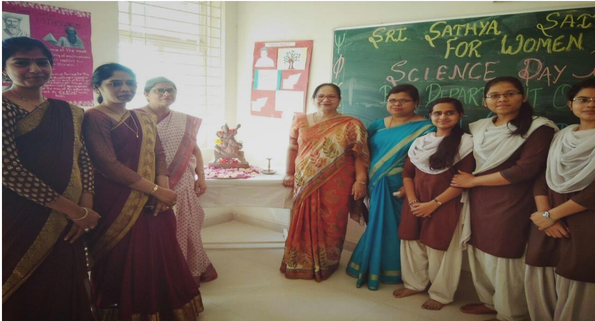
National science Day celebration 28/02/20 Chart competition on Works of famous mathematicians and Scientists