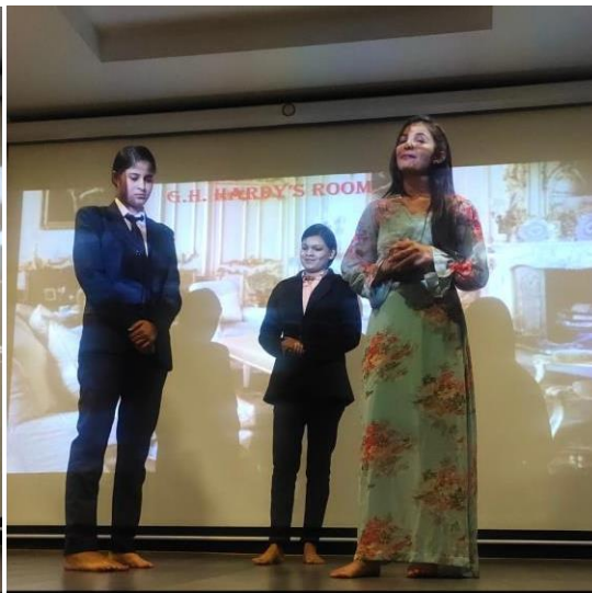
Anna nagar, ward no.59, Habib Ganj, Bhopal, Madhya Pradesh 462023, India

Latitude Longitude 23.227426° 77.4450032° Local 12:00:55 PM Altitude 0 meters GMT 06:30:55 AM Thursday, 22-12-2022