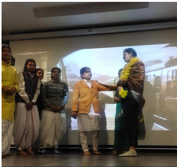
Anna nagar, ward no.59, Habib Ganj, Bhopal, Madhya Pradesh 462023, India

Latitude Longitude 23.227426° 77.4450032° Local 12:00:55 PM Altitude 0 meters GMT 06:30:55 AM Thursday, 22-12-2022