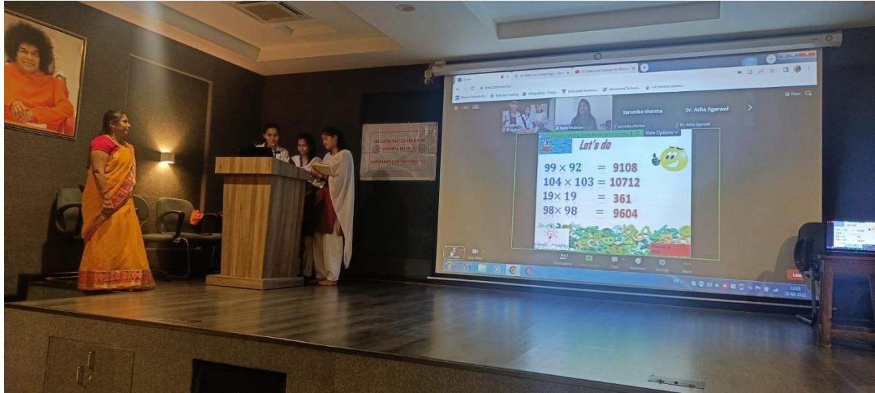
National workshop (hybrid mode) for students on Vedic Mathematics 29-30 September 2022